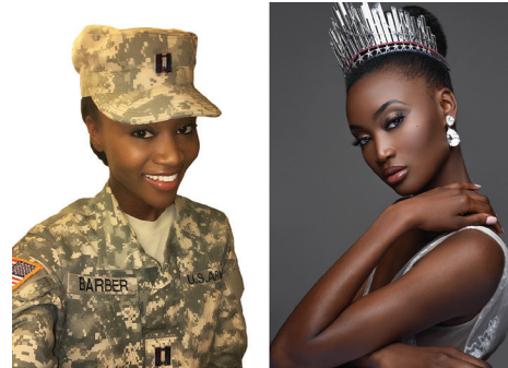
2018 Grand Marshal Deshauna Barber

All are invited to enjoy the festivities, which include military