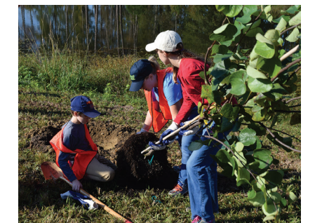
Volunteers gathered at Thunderbolt Park in November to plant three dozen trees around the lakes and along the park's multi-purpose paths.